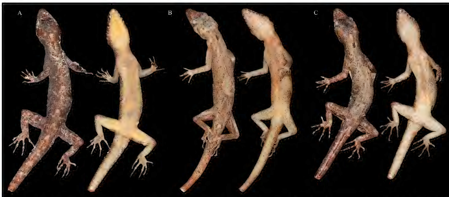
Fig. 3. Dorsal and ventral aspects of the type series of Cnemaspis anslemi sp. nov. (A) Male holotype, NMSL.2019.14.01, (B) female paratype, NMSL.2019.14.02, and (C) female paratype, NMSL.2019.14.03 from Udamaliboda, Samanala Nature Reserve, Sri Lanka.

granules linearly arranged; 19–21 belly scales across venter; precloacal pores absent in males, 14–15 femoral pores on each side in males separated by 9–11 unpored interfemoral scales in males, and 2–3 unpored posterior femoral scales in males; 111–117 ventral scales; 87–91 midbody scales; subcaudals smooth, subhexagonal, enlarged, subequal, forming a regular median row; 8–9 supralabials; 8–9 infralabials; 16–17 total lamellae on digit IV of manus, and 20–21 total lamellae on digit IV of pes (Table 1). Dorsal body reticulated brown, black, and white; two large oval patches present on the neck; chin and gular with bright yellow, and femur dirty yellow.